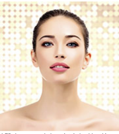
LED therapy can help maintain healthy skin.

people may feel a slight tingling, or see flashes in their vision temporarily as a result of having a light source close to their face. Keeping your eyes closed and covered during the treatment will help avoid this.