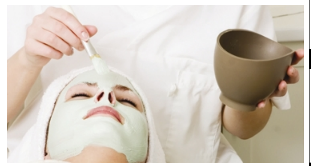
Internal wellness complements your skin care treatments, providing optimum results.